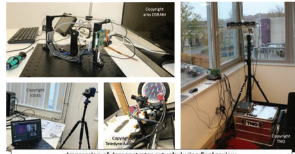
Impression of demonstrator setup's during final review